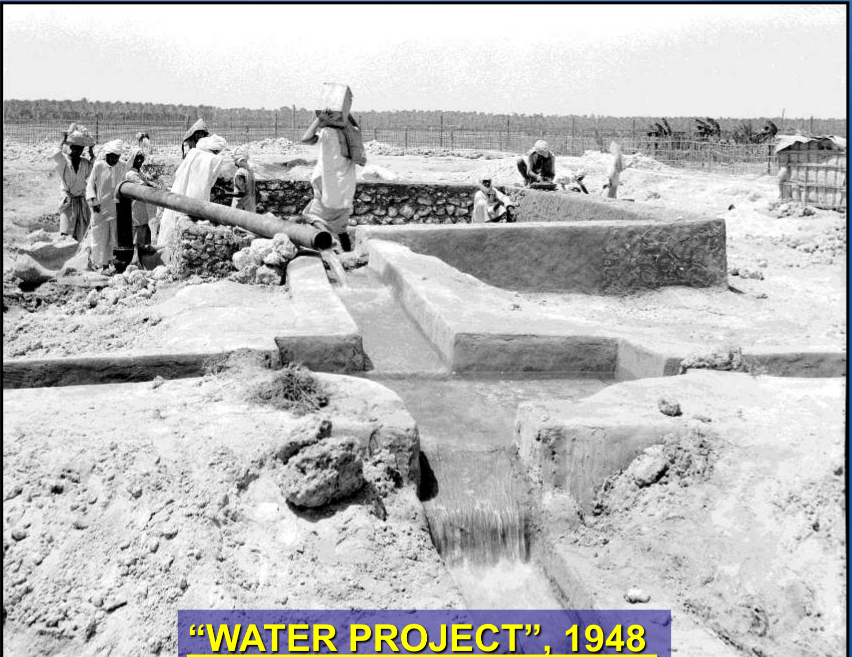
“WATER PROJECT”, 1948